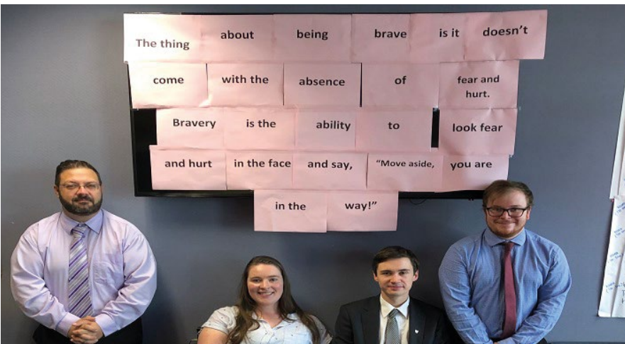
The Employment, Coroners and Environment Court teams in Wellington put together some encouraging quotes to help our colleagues and each other through this difficult time.

“In times of darkness, look to the light and the good. My thoughts, prayers and love are with the victims, their families and all those impacted. Kia kaha to all the people in and of Aotearoa.”