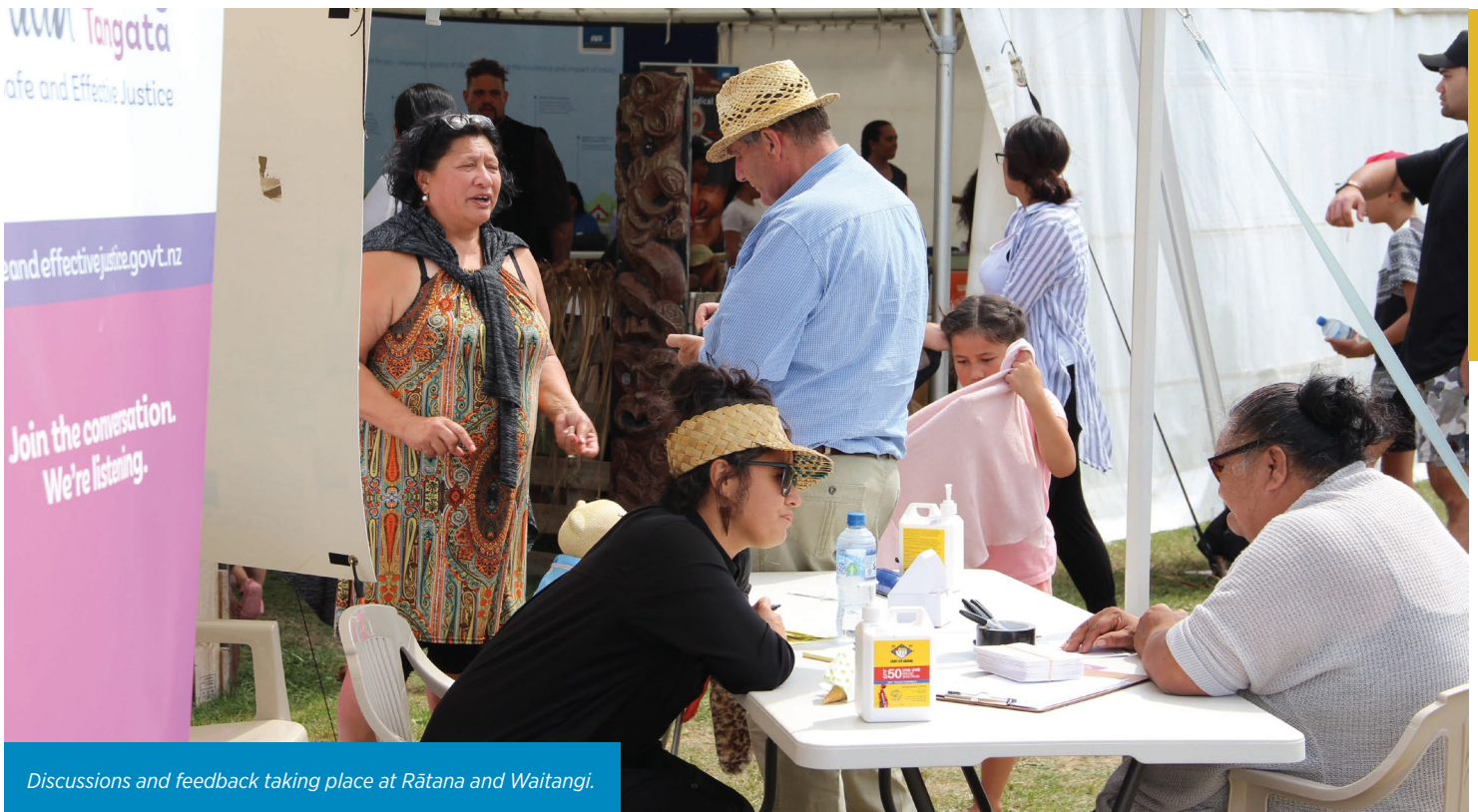
Discussions and feedback taking place at Rātana and Waitangi.