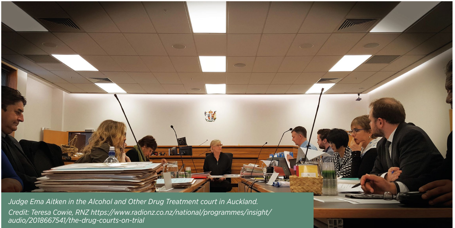
Judge Ema Aitken in the Alcohol and Other Drug Treatment court in Auckland.