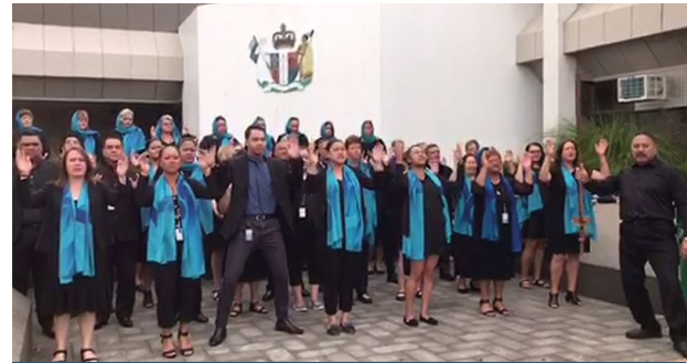
Rotorua District Court shared a video of them performing a haka