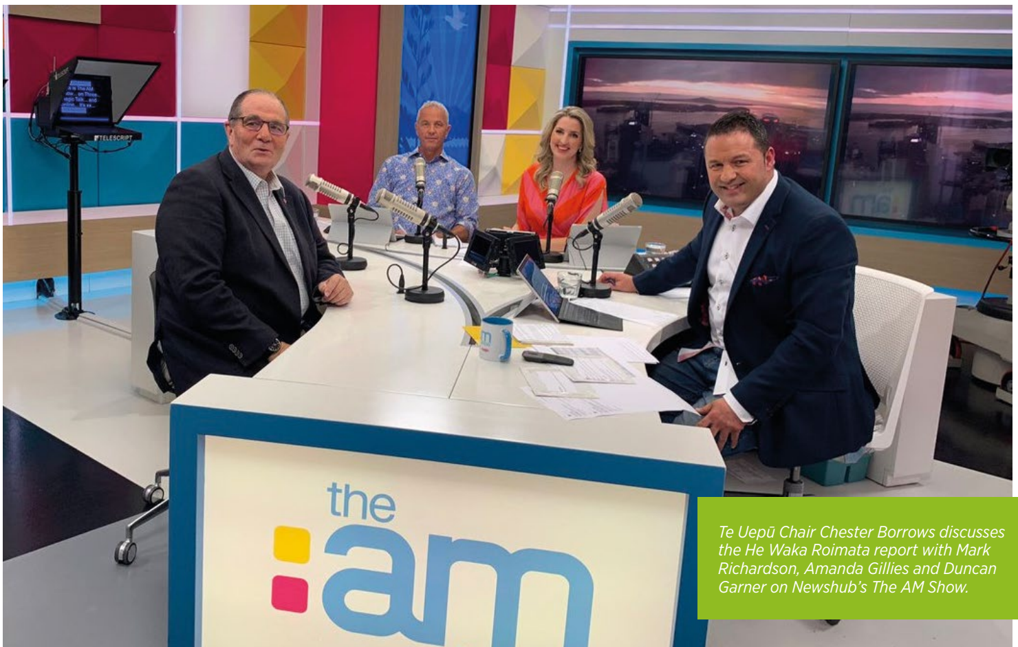
Te Uepū Chair Chester Borrows discusses the He Waka Roimata report with Mark Richardson, Amanda Gillies and Duncan Garner on Newshub's The AM Show.

“There is widespread recognition that at every point in their lives, and over generations, Māori experience disadvantage that increases the risk they will come into contact with the criminal justice system,” he adds.