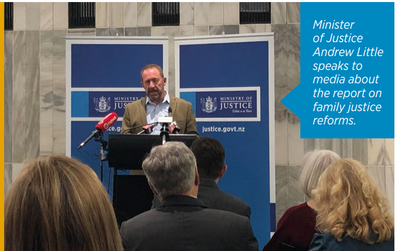
Minister of Justice Andrew Little speaks to media about the report on family justice reforms.

The Independent Panel considering the 2014 family justice system reforms has released its final report to the Minister of Justice, Andrew Little.