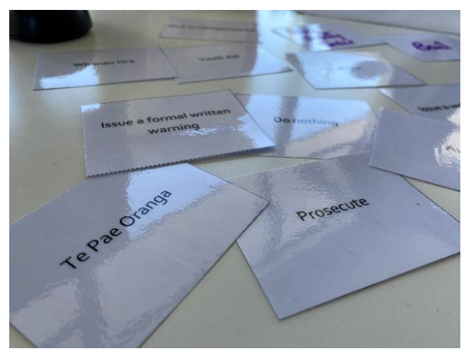
The team created prompt cards to gain insight into officers' decision-making processes

Supported resolutions are an important part of the Police's new Reframe strategy, keeping people out of court and prison and addressing the underlying causes of offending. BSA are working with the Māori, Pacific and Ethnic Services team (MPES) and Reframe, bringing a behavioural lens to the supported resolutions workstream.