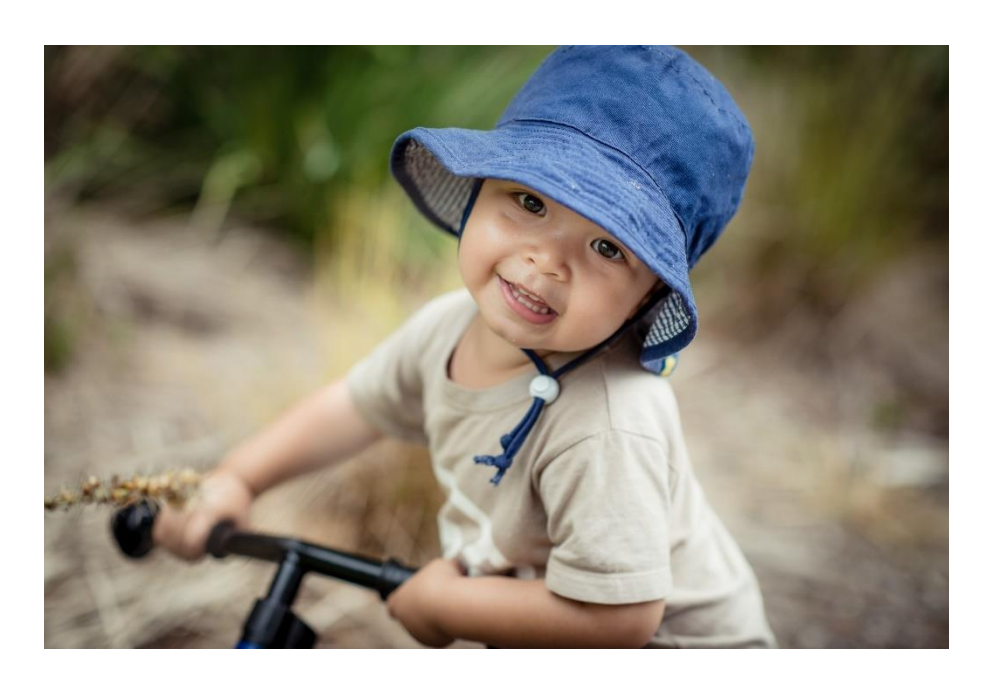
Parenting Plan Workbook

To help you decide what's best for your child after a separation or change in family situation