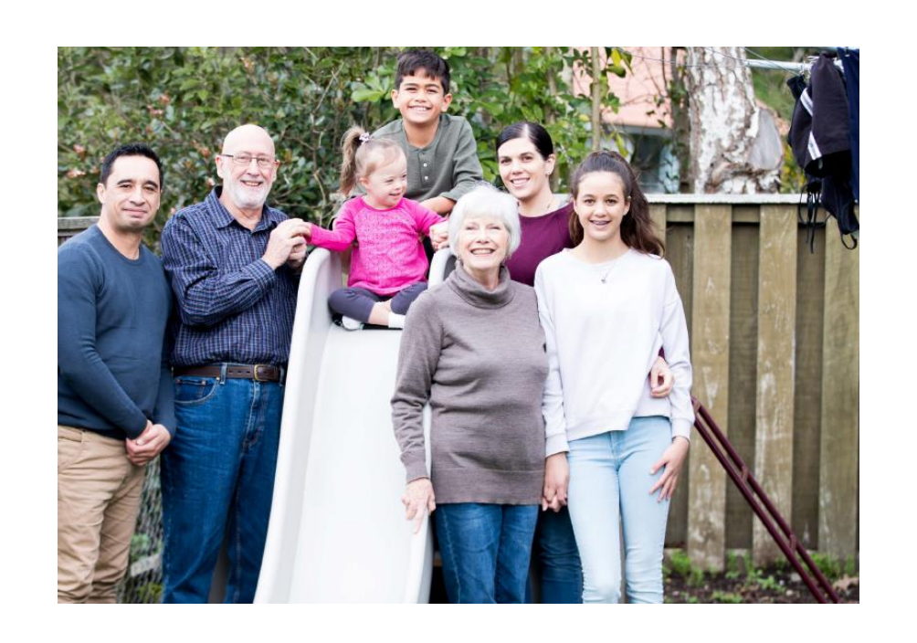
Part 2: Guardianship decisions (home life, school, healthcare, and other decisions)

Guardians are adults who are responsible for the upbringing and care of a child. When most children are born, their parents automatically become guardians. The Family Court can make other adults, like a grandparent, an extra guardian. After a separation or change in a family situation, guardians should work together to decide how a child will be raised.