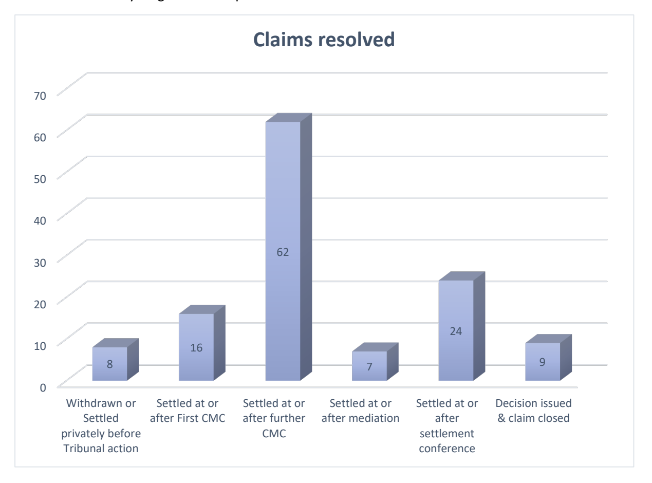
Graph 1: Claims resolved by stage since inception