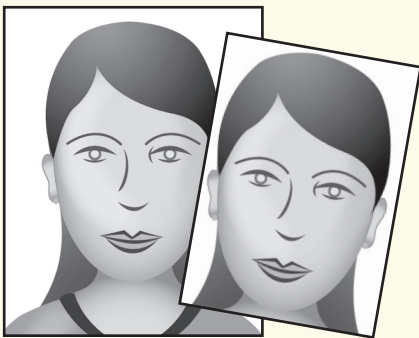
(Clean photograph needed)