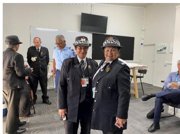
Māori Wardens at the launch of Whariki Haumarū