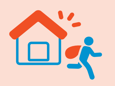
10% experienced burglary

19% of households experienced one or more household offences