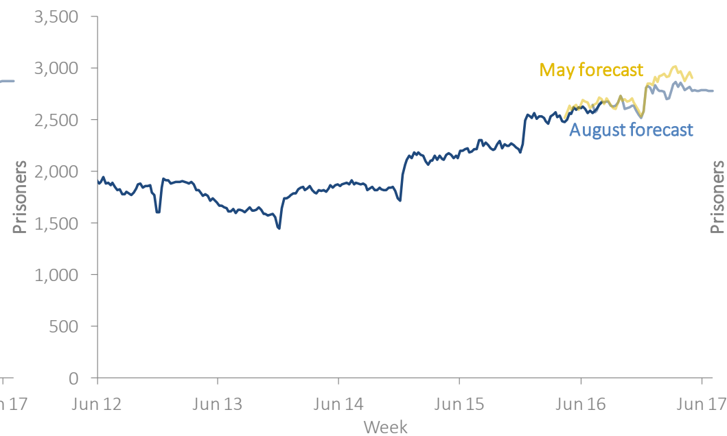
Remand Prison Population