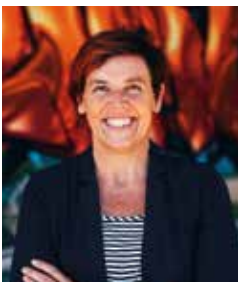
Jan Logie MP

Parliamentary Under-Secretary to the Minister of Justice (Domestic and Sexual Violence Issues)