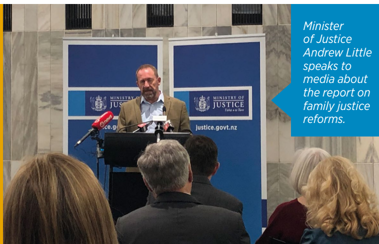
Minister of Justice Andrew Little speaks to media about the report on family justice reforms.

The Independent Panel considering the 2014 family justice system reforms has released its final report to the Minister of Justice, Andrew Little.