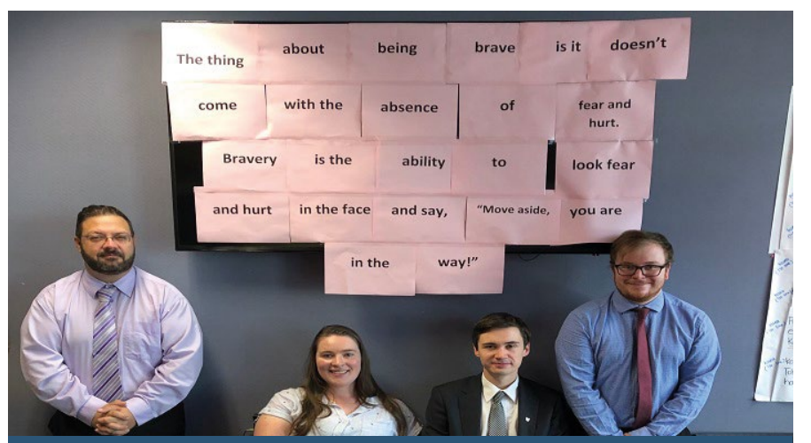
The Employment, Coroners and Environment Court teams in Wellington put together some encouraging quotes to help our colleagues and each other through this difficult time.

"The tears flow for the people who lost their lives and for all those that have to find their way through this. Please know our hearts break for you and you do not cry alone. I pray for you and those you have lost, much aroha (love) Christchurch."